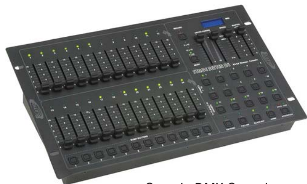
Sample DMX Console

580 Mayer Street - Building # 7 - Bridgeville, PA 15017 USA