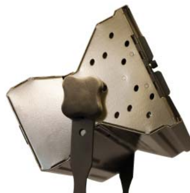
Profile of SeriesONE Fixture with Double Accessory Track