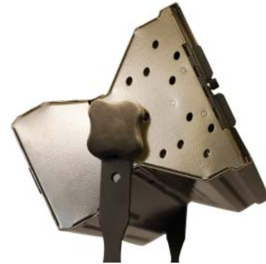
Profile of SeriesONE Fixture with Double Accessory Track