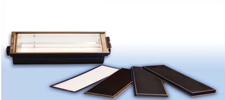
Accessories (for 2- and 4-lamp fixtures)