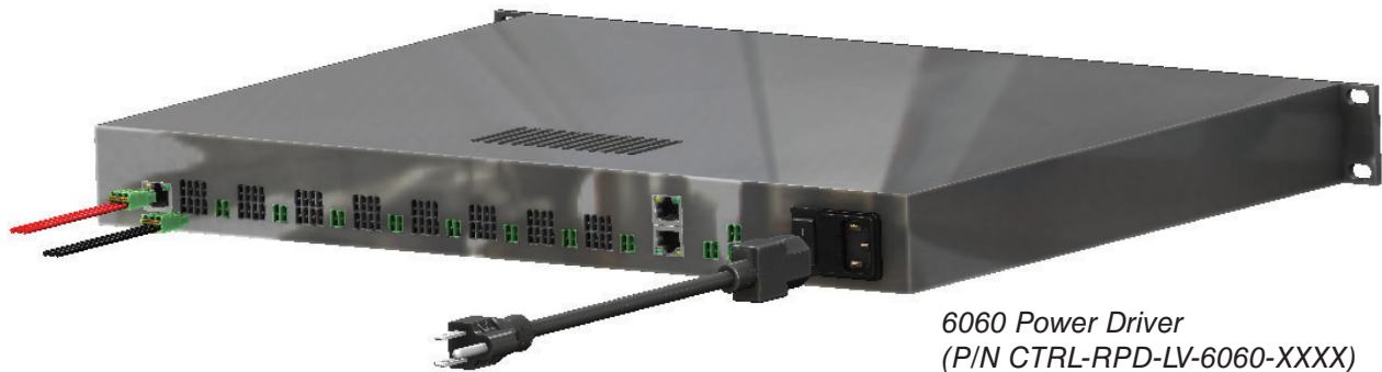
6060 Power Driver (P/N CTRL-RPD-LV-6060-XXXX)

Fixtures are provided with 75-ft of cable that can be trimmed to length. Longer cables are available upon request. Phoenix connectors on the back of the 6060 Power Driver.