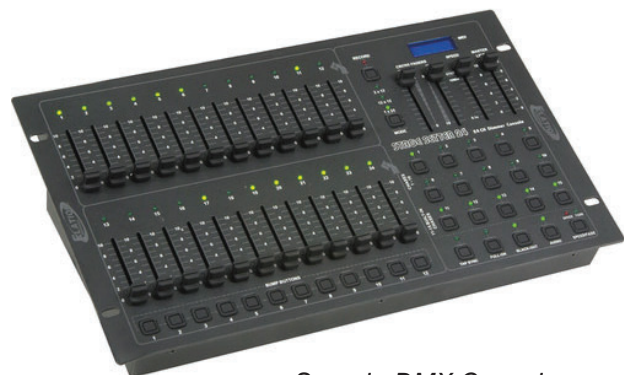
Sample DMX Console

580 Mayer Street - Building # 7 - Bridgeville, PA 15017 USA