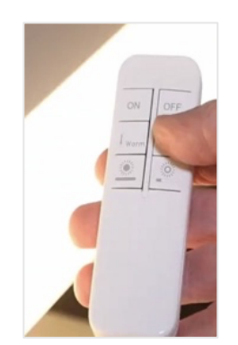
Professional lighting with dynamic control at your fingertips.